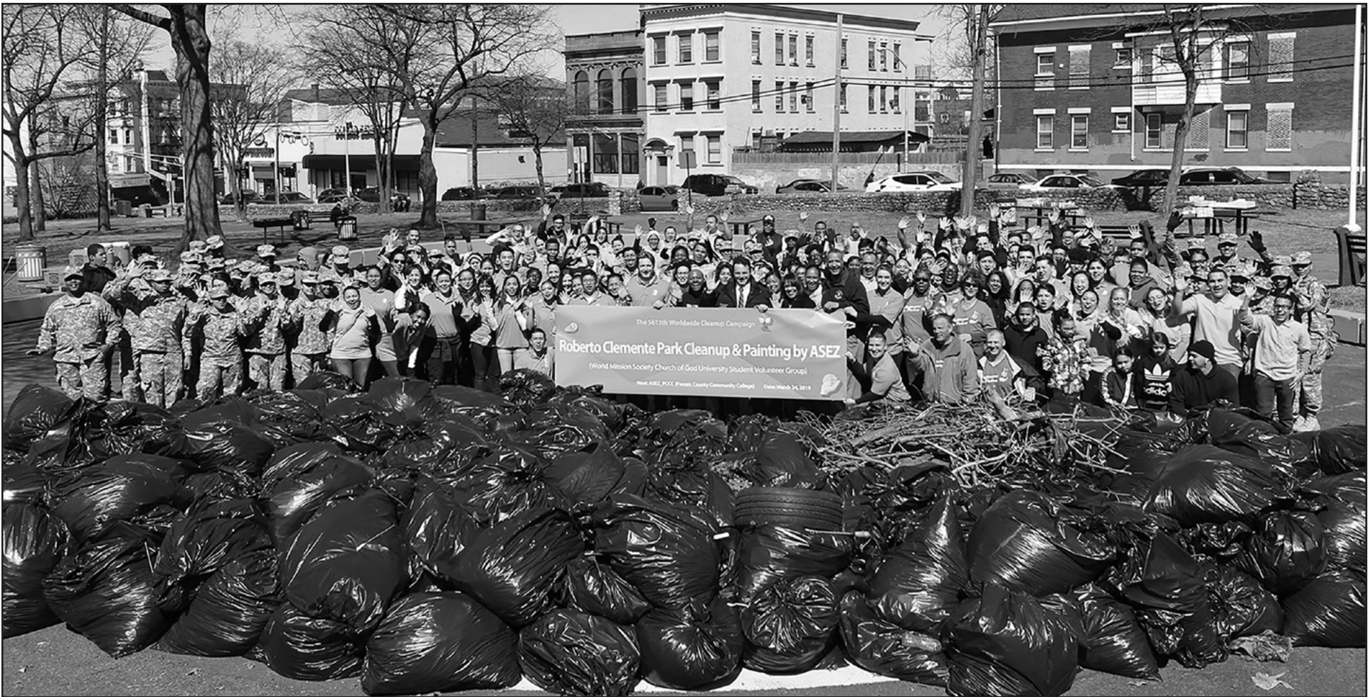
Local Asez groups came together for the recent Roberto Clemente Paterson Cleanup.