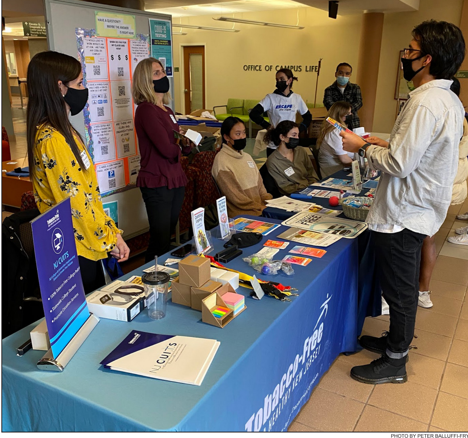
The Escape the Vape event provides students with numerous resources, including information about vaping, tobacco, mental health and addiction, and the COVID-19 vaccine.

Events such as Escape the Vape aim to educate students about what vaping does to the body, in hopes that people will have enough information to make an informed decision regarding what they put into their bodies. Between the research of this harmful habit and schools around the world advocating against vaping, there seems to be a more optimistic future ahead.