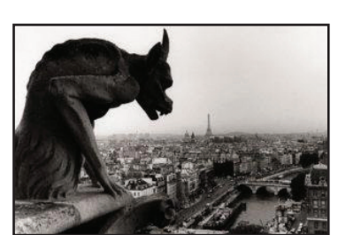
Photo "Paris", above, and "Versailles", right, included in the "a small thing but my own—Through the Lens of Jim Del Giudice" exhibition at CCM.

A prolific photographer, Del Giudice's works included the black and white "Paris" and vibrantly colored "Versailles." To my eyes, both are more appealing than a large swath of contemporary art found in galleries and museums. Once asked what in-