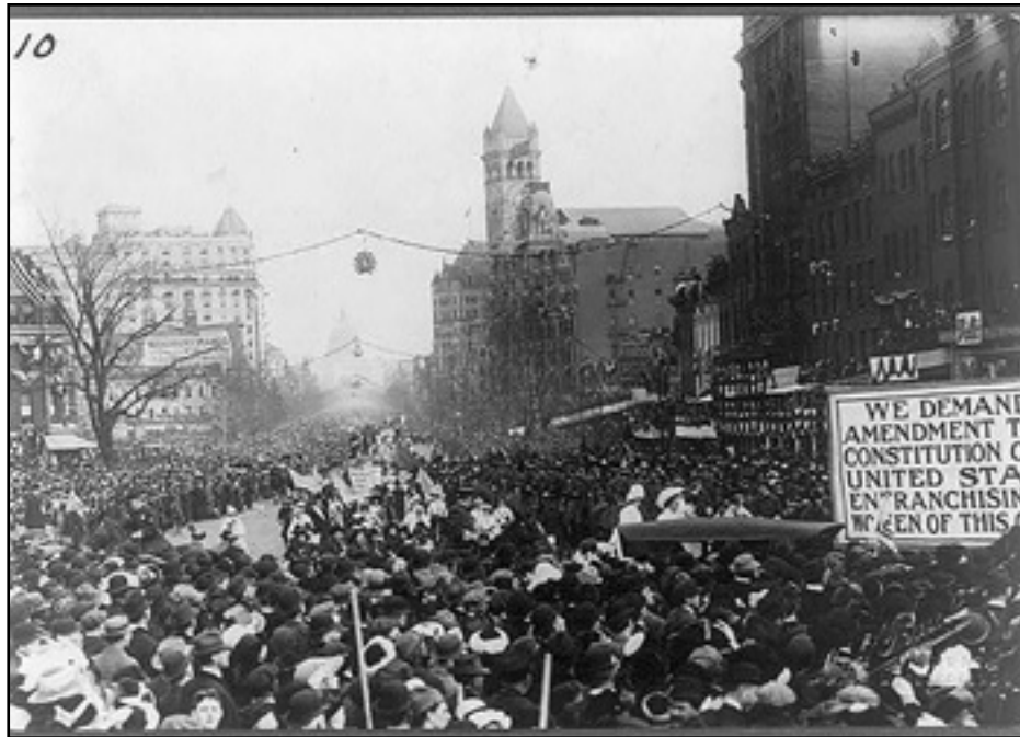
Suffrage March in New York City circa 1912.

Clyde began the conversation by mentioning how the suffrage movement began in the United States in conjunction with the abolitionist movement