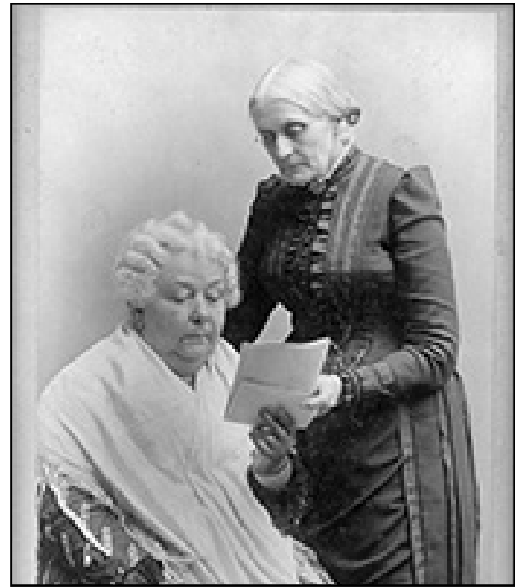
Susan B. Anthony (sitting) and Elizabeth Cady Stanton.

of the 1830s and 1840s. Notable abolitionist Frederick Douglass spoke at the Seneca Falls Convention, an event dedicated to discussing women's right to vote and political autonomy.