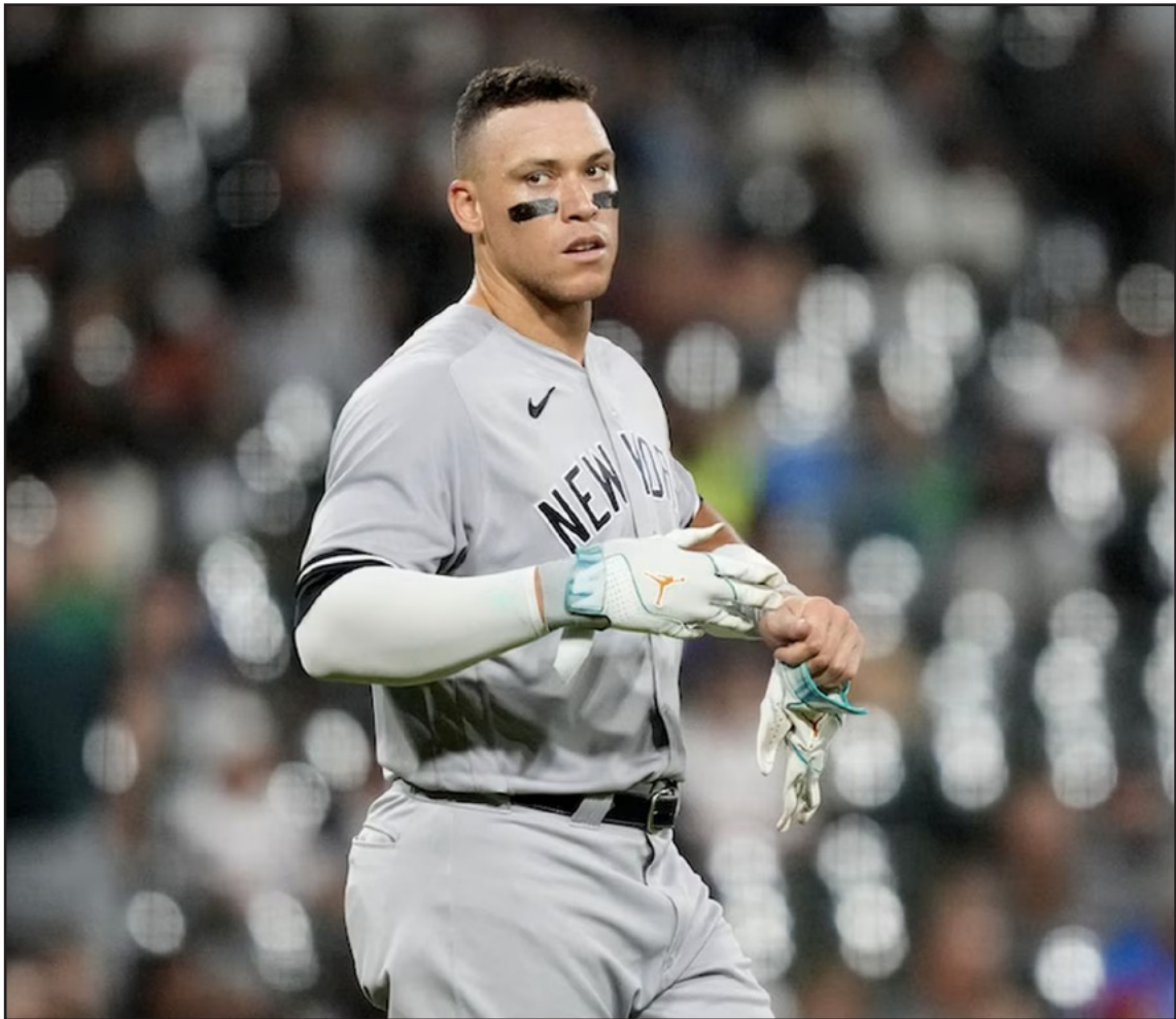
Aaron Judge called the 2023 Yankees a "failure."

trary" criticism. I replied that in his next job search, he should tell the interviewer that he's had one good year in the last 23 and see how that turns out.