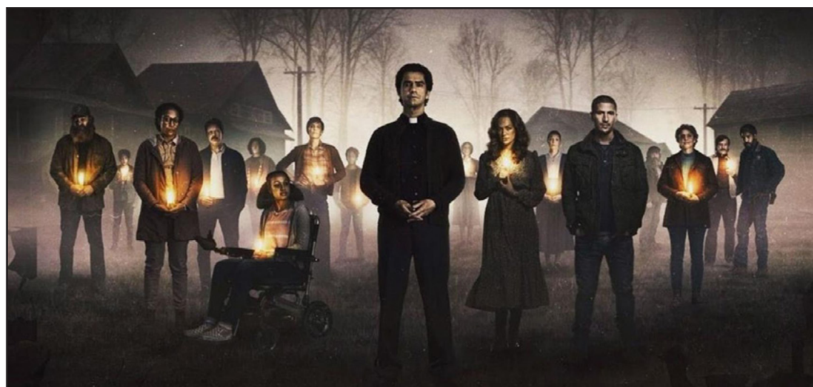
Midnight Mass , a popular Netflix horror show.

While unable to enter Netflix's most-watched shows list, Midnight Mass is arguably one of the best horror shows of all time. Directed by long-time horror filmmaker Mike Flanagan, it tells the story of Riley Flynn, played masterfully by Zach Gil-