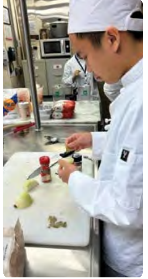
Opportunity Programs are administered in partnership with the Office of the Secretary of Higher Education as part of the County College-Based Center for Adult Transition Grant.