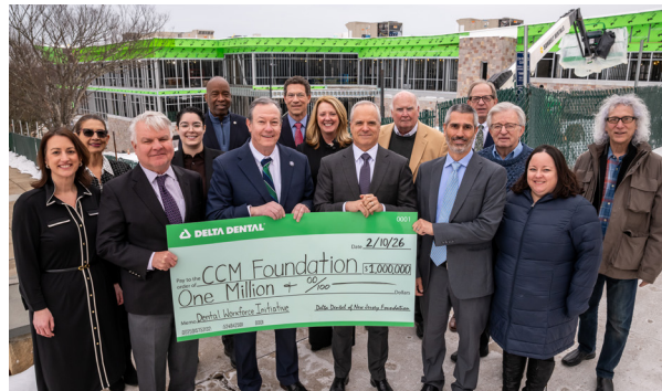
Delta Dental of New Jersey awards one million dollars to CCM.