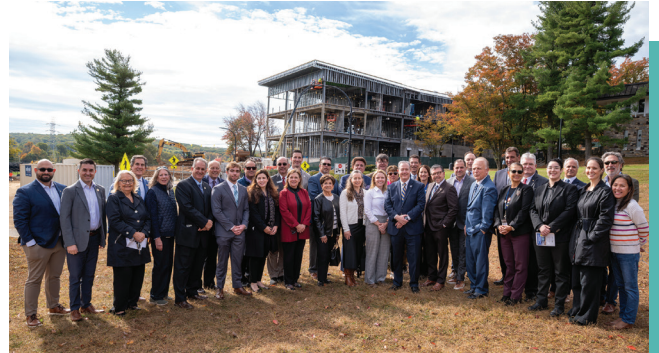
Center for Health Professions Building Dedication Ceremony

The center is slated to enroll an additional 1,500 students each year with graduates strengthening workforce development and addressing healthcare shortages. This project will enable CCM to invest in healthier communities and brighter futures for Morris County and beyond. If you are interested in partnering with CCM's Business or Culinary programs, contact the Foundation today.