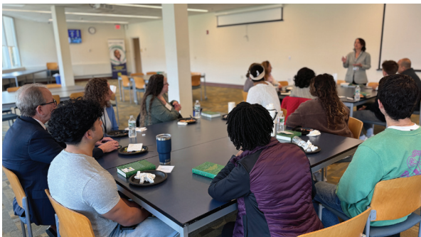
Fall 2025 Scholarship Society Welcome Luncheon