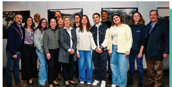
"Footprints in Time" gallery opening

Over 150 community members attended the opening of "Footprints in Time," a historical photography exhibit at CCM's Gallery featured nearly 100 images restored from glass negatives from late 1800s Dover using digitization techniques in CCM's photography studio. In collaboration with CCM, College Promise Program students and the Dover Historical Society, the project brought history and artifacts to life giving students a hands-on opportunity to demonstrate the power of community-based learning in action. CCM's College Promise Program expands access to post-secondary education and preparation for academic and career success for students in the Dover and Morristown communities.