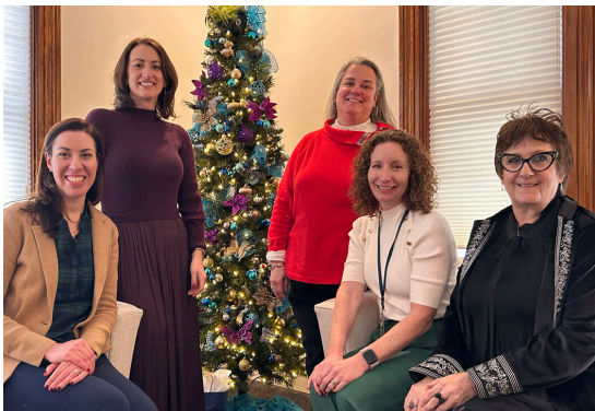
CCM Foundation Staff