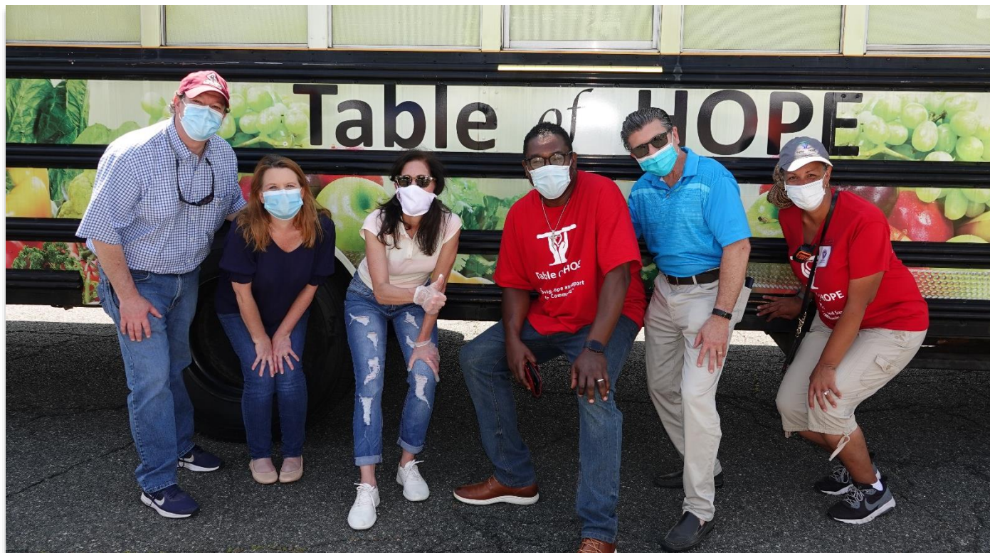
Table of Hope at CCM Offers Free Food to Those in Need