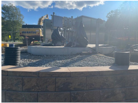
Existing Sewer Lift Station (Randolph Township) at the Plant Maintenance Building

This work provides a new sewer lift station, generator, landscaping, and a new set of lines to and from Route 10. The lift station serves CCM and a few buildings to the west along Route 10. CCM is the main beneficiary of the construction. The project will be completed in phases. Phase I will include constructing the new sewer lift station with an anticipated completion of October 2023. Phase II will include the installation of the new generator which has a longer lead time and anticipated completion of Spring 2024. This project is funded through the Township of Randolph.