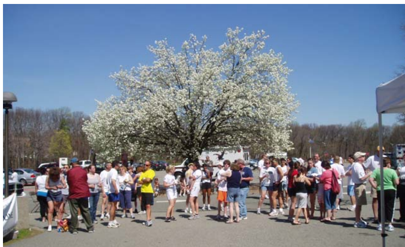
Finish Line - Congratulations to Everyone!

If you missed this 5K, you will have the opportunity to participate at the Verizon Wireless Corporate Classic 5K on July 16 at 7:30 p.m. in Morristown. Last year over 4,000 runners and walkers participated in this 5K race (including a team from CCM) who raised money for the Jersey Battered Women's Services. To register for the race and join our CCM team, please go to www.verizonwirelessclassic.com and follow the instructions for registration under "Company Team -- Individual Pay."