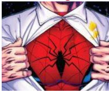
Exhibit Honoring Joe Kubert